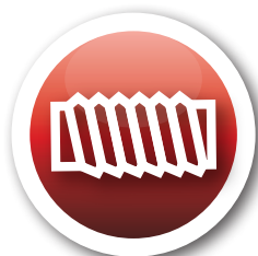
Screw thread dimension M4.0x0.7