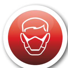
Wear a face mask