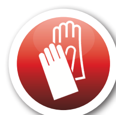
Wear hand protection