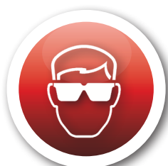
Wear eye protection