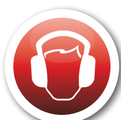
Wear hearing protection