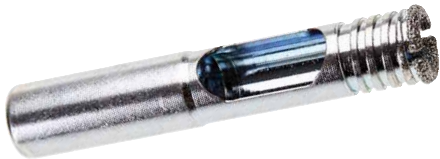
Part No. PTCWFSOLN